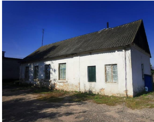
Permanent structure, asset # No.644/C-50961 Floor area: 91.2 m 2