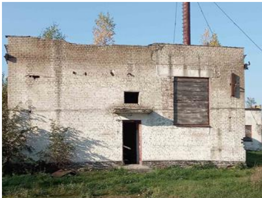
Permanent structure, asset # No.644/C-50955 Floor area: 193.1 m 2