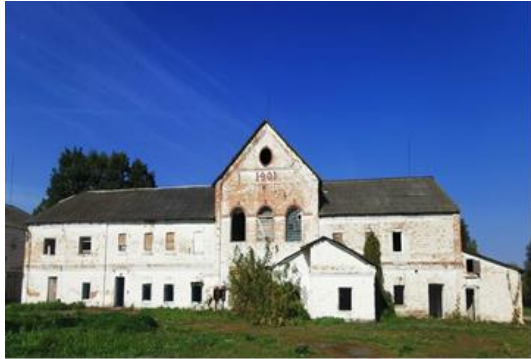
Permanent structure, asset # No.644/C-50968 Floor area: 1243.1 m 2