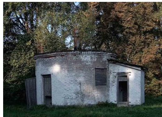
Permanent structure, asset # No.644/C-50963 Floor area: 15.3 m 2