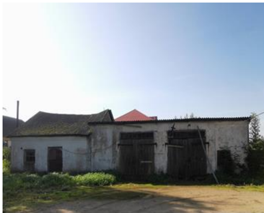
Permanent structure, asset # No.644/C-50958 Floor area: 130.1 m 2