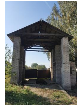
Permanent structure, asset # No.644/C-50960 Floor area: 30.1 m 2