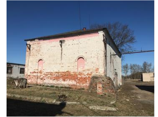
Permanent structure, asset # No.644/C-50953 Floor area: 148.9 m 2