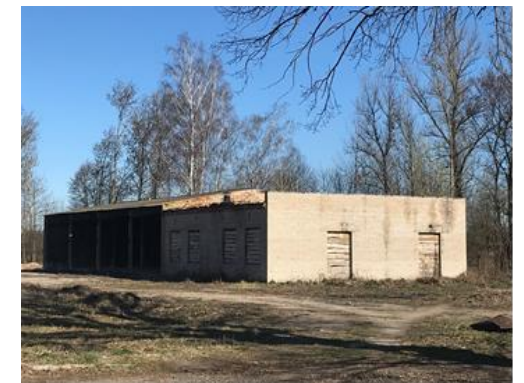
Permanent structure, asset # No.644/C-50966 Floor area: 408.5 m 2