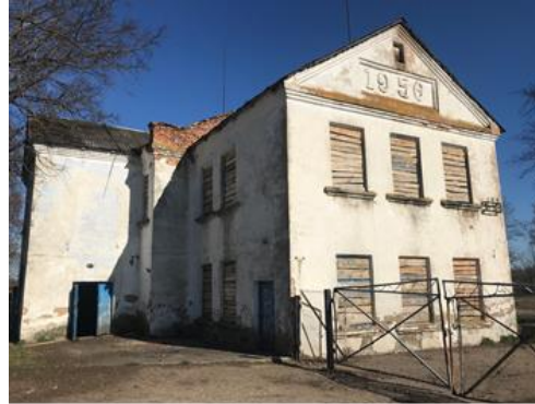
Permanent structure, asset # No.644/C-50957 (Office building) Floor area: 233.9 m 2