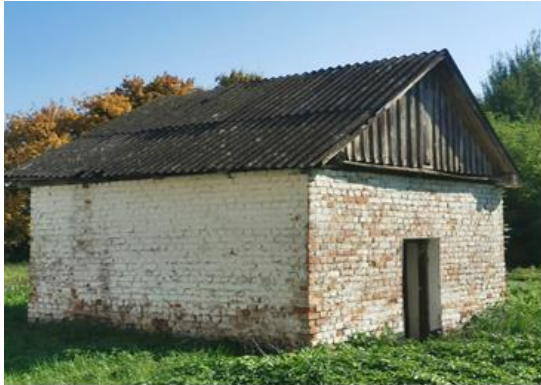
Permanent structure, asset # No.644/C-50959 Floor area: 19.7 m 2