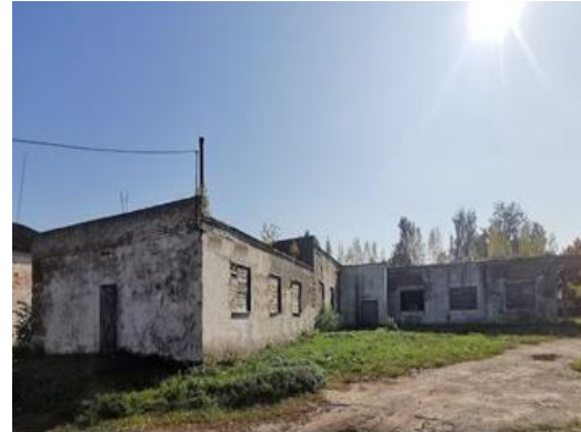
Permanent structure, asset # No.644/C-50956 Floor area: 891.3 m 2