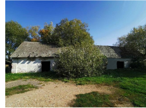
Permanent structure, asset # No.644/C-50967 Floor area: 117.6 m 2